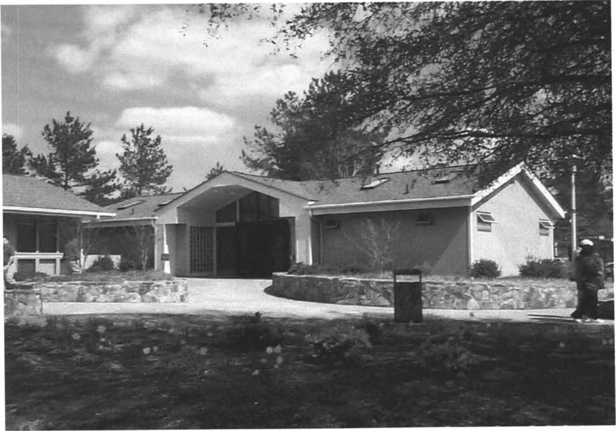
WELCOME CENTER RESTROOMS FA# 78-25-10